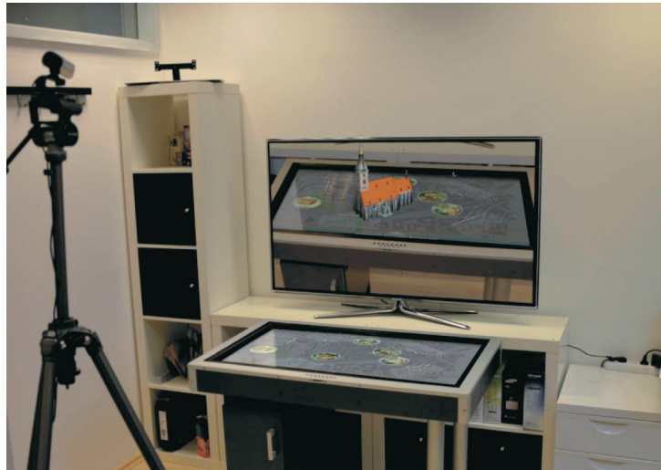
Figure 1. An example application of augmented reality running on the MARS: Bratislava sights are mixed with the interactive map of the old town.

This paper describes the combination of a multi-touch user interface with an augmented reality system and focuses on both of the two components. We describe the basic concepts of each in the next two sections. Then, we present the related work in combining the two and describe methods of interaction with the combined system. In Section 3, we describe our setup which creates a smooth dual-view environment for object/data visualization. We also propose several usage scenarios for this multi-touch augmented reality system.