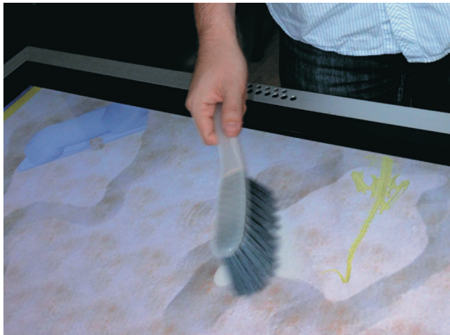
Figure 4: Using a hand sweeping brush to discover a small dinosaurskeleton hidden in the virtual sandbox.

This activity is perceived as entertaining by the users and can e.g. be used for edutainment purposes in museums.