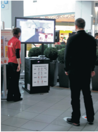
Figure 1: Flying over Bratislava at the Virtual world exhibition at the Avion shopping mall.