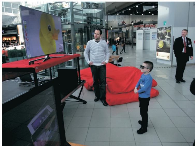
Figure 3: A young visitor observing a virtual duck in our Virtual 3D Showcase

Computer graphics for presentation of cultural heritage is one of our major lines of research. We designed a prototype virtual 3D showcase for interactive observation of 3D objects. Again, in order to replace the synthetic input options, we use the user’s body and posture as input device. The goal is to display a rendered 3D model of an object which reacts to user movement and rotates around horizontal and vertical axes. This object rotation relative to user movement might create an illusion of walking around a physical object showcase, such as in a museum or a gallery.