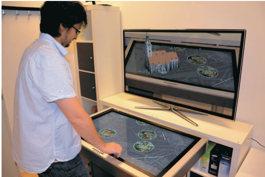
Figure 6: MARS set-up with an interactive map of Bratislava augmented by 3D models of historical sights.